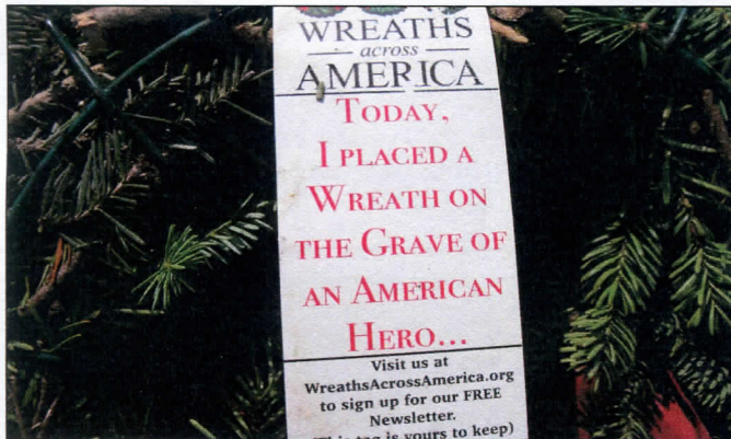
WREATHS ACROSS AMERICA: Sister Leslie Wickham placed wreaths on veterans' graves at Cypress Hills Cemetery on Dec. 15, 2018.