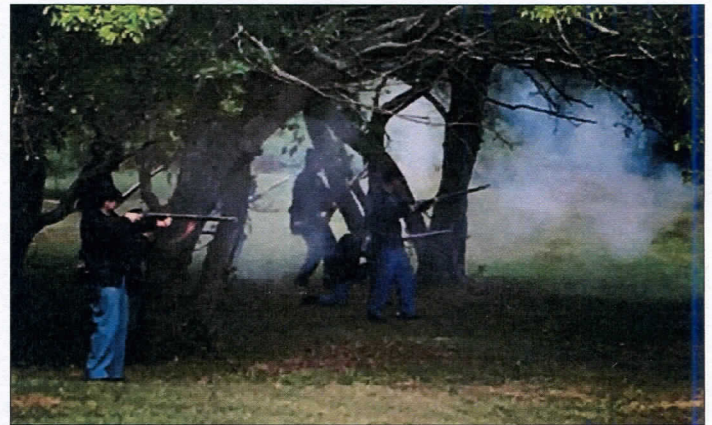
Reenactment of Battle of Antietam at Islip Grange