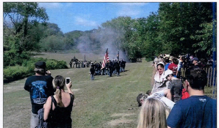
Attendees watch the battle reenactment