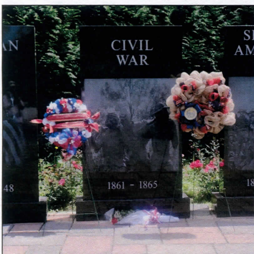
The Civil War Panel at the Wall of Wars Monument, VAMC Northport.