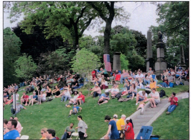
Green-wood Annual Memorial Day Concert: May 30, 2016 - Brooklyn, NY. "I always attend, and thoroughly enjoy [it]. It's a real family and community celebration."

* Also published in The Drumbeat in National's General Orders