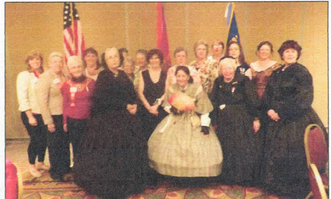
NYDUVCW AT THE SUVCW GRAND BANQUET, May 2nd, at the Saratoga Springs Holiday Inn.